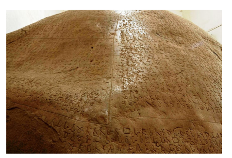
Emperor Ashoka's Rock Edicts