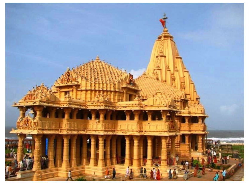
Somnath Temple, Prabhas Patan

The Gir National Park and Wildlife Sanctuary (60 km away from Junagadh), the only remaining habitat of Asiatic lions; Chorwad Sea Resort (66 km); Somnath Temple at Prabhas Patan (88 km); and Tulsi Shyam Hot Springs (160 km) are some of the major tourist attractions near Junagadh.