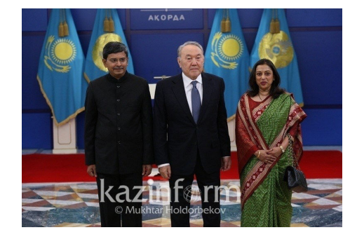
Celebration of Pravasi Bharatiya Divas and Vishwa Hindi Divas in Astana