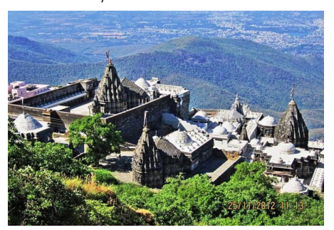
Jain Temples in Girnar Mountain